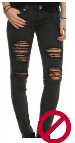
Pants must not have any holes or fraying