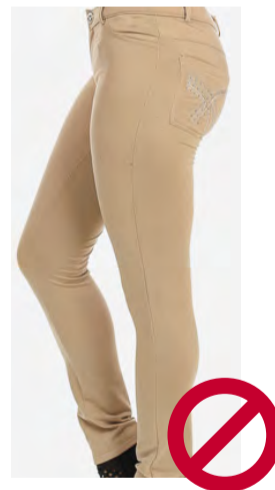
Pants should not be form-fitting or have decorative stitching or design elements