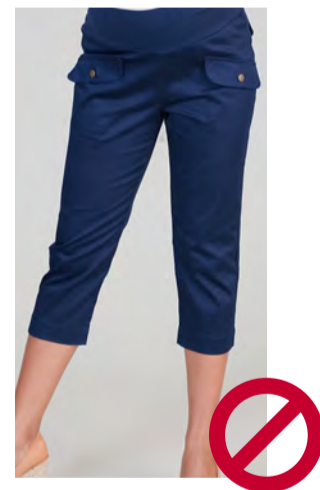
Capri pants are not permitted