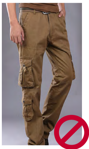
Cargo pants are not permitted