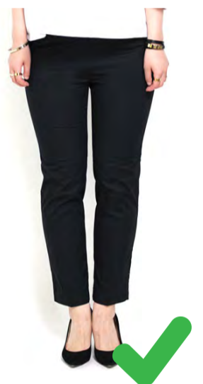
Ankle-length pants are approved